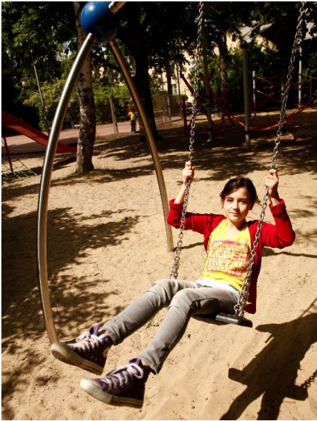
Swingo.2.3 The bigger one-bay-swing takes a child to new heights. In order to sustain the increased dynamics, the structure is supported by tripods.